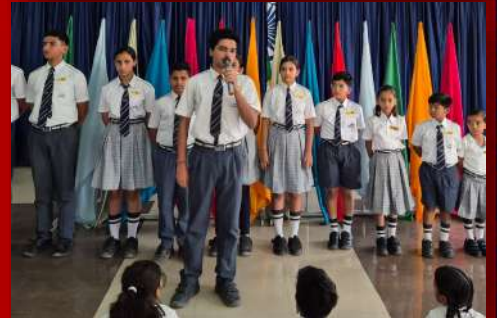
(Empowering Young Leaders)